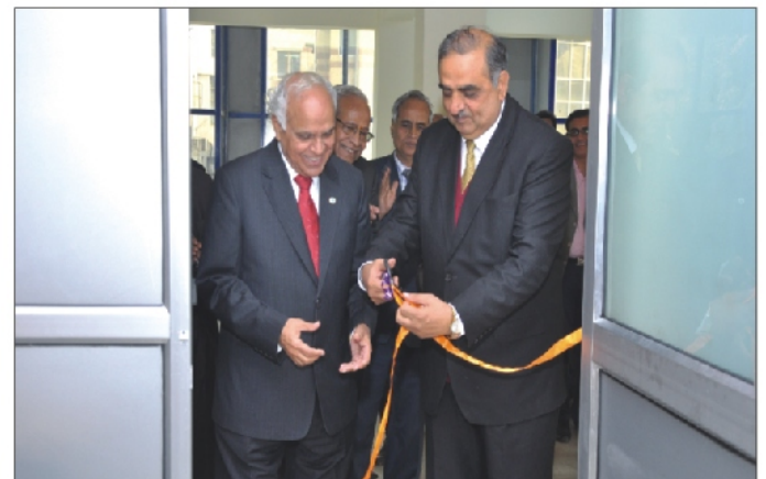
Class Room Inauguration