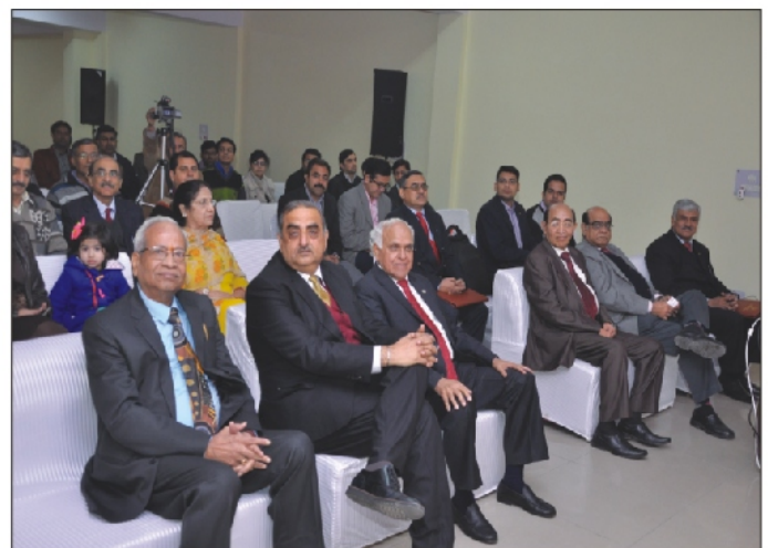
Welcome to the Dignitaries to the Dais